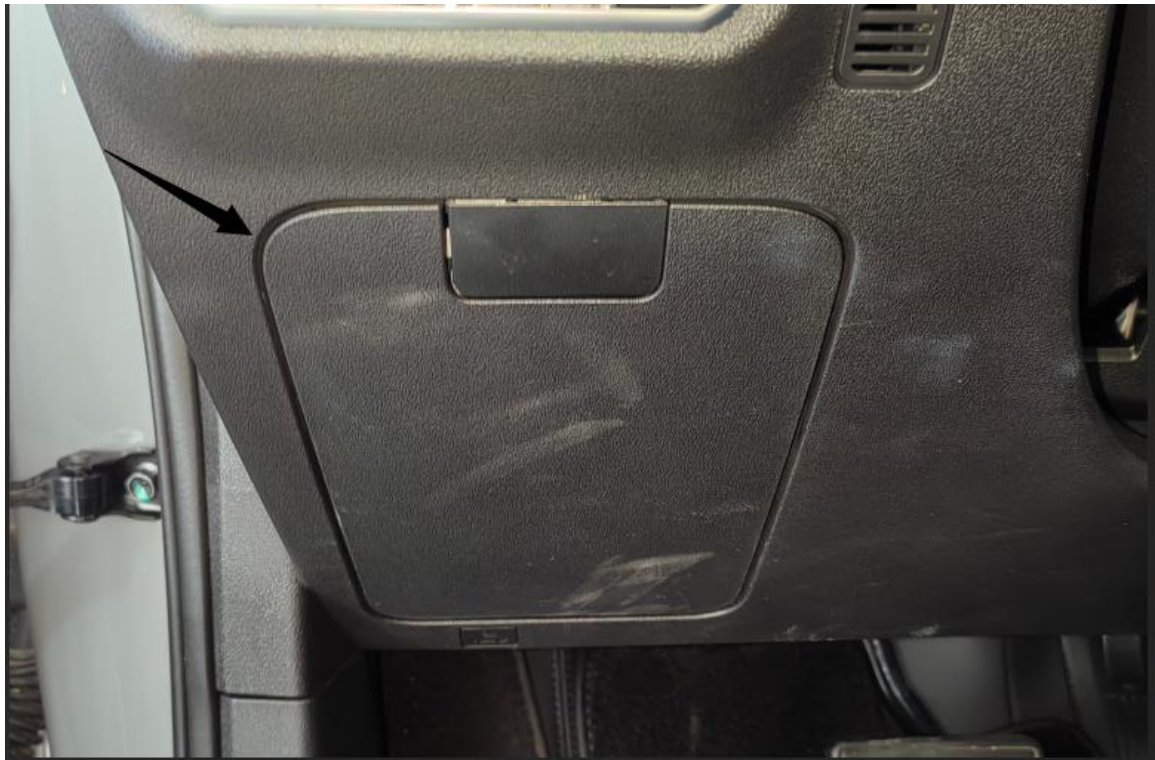
The fuse positions of B+ and ACC are shown in the figure.